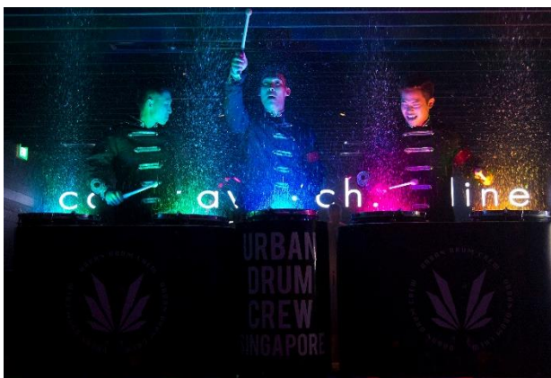
A colourfully vibrant drumming performance by Urban Drummers