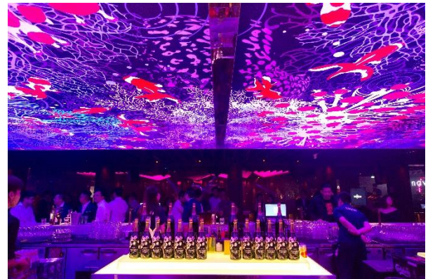
Capital, Zouk: Main Bar Area