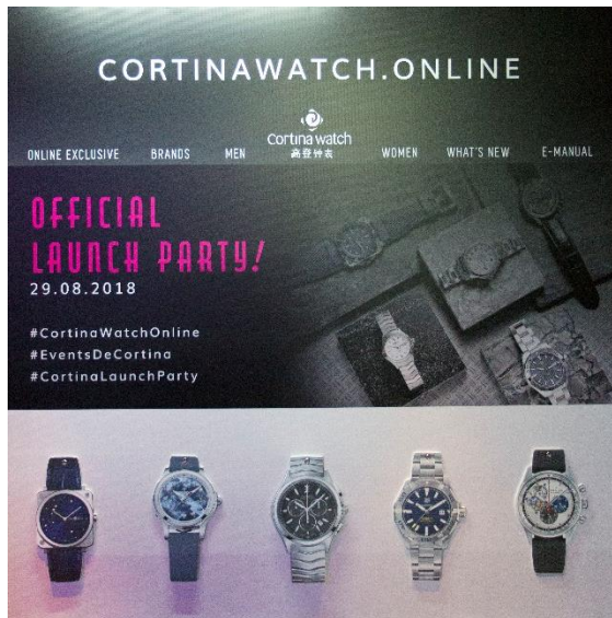
Cortina Watch Photo Booth