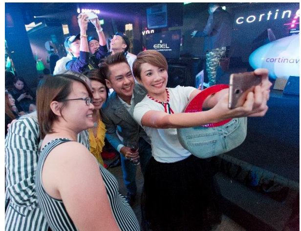
Guests taking a "Wefie" during the games