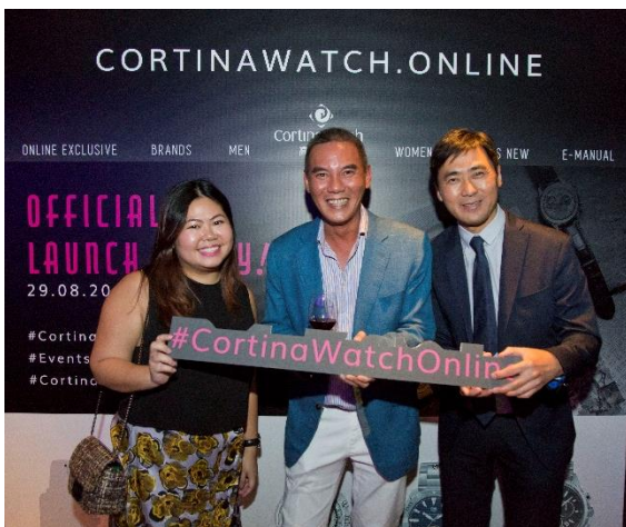
Cortina Watch Photo Wall